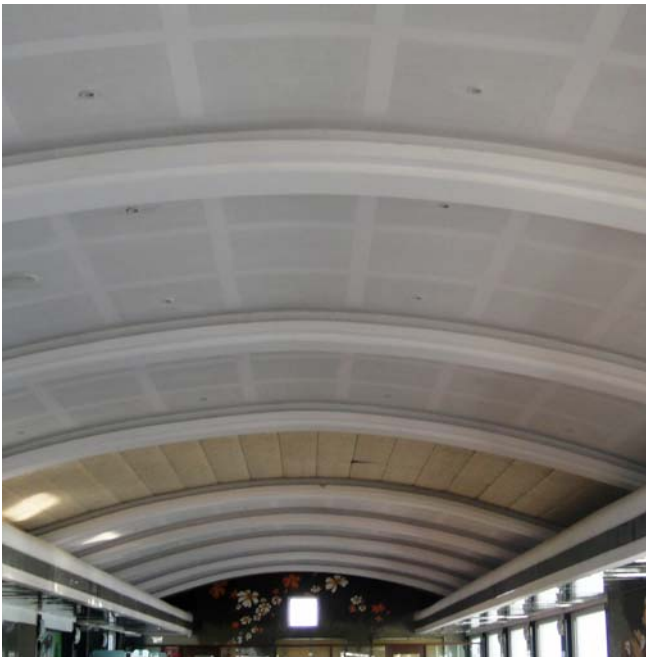
Kamat Yatrivas, Bengaluru

Optimum method for large seamless ceilings means using Pixel 3/8 with tapered edges