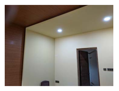
The Government of West Bengal chooses surfaces finishes from Anutone to refurbish its Circuit Houses

The Circuit House at every district headquarter serves as an important venue for Central | State government ministers to interact with local government and district officials. A unique combination of Tufbloc and Slats Surco ceilings and panelling alongwith Soak Cord panels facilitate sound interiors for such interactions.