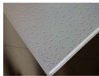
Slate Spritz – pin and fissure perfs

Caution! Due to optical illusion some of the designs can look bubbled up but move your vision side to side or up to down and you will note the true indentations carefully embedded on the surface