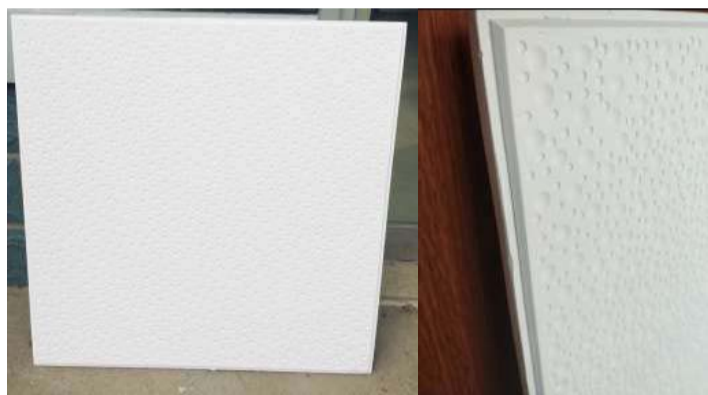
Slate Polka – circular perfed in dual diameters