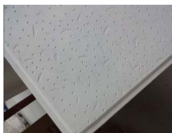
Slate Shimer – micro perfs and leaf design