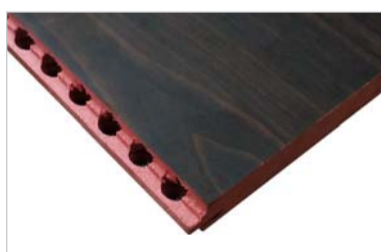
Pink edge means true FR - FIRE RETARDANT - as per 5-test protocol

How will you know? It is actually very easy! Look at the edges of the panel and if it yellow then it FLAME RESISTANT and if it pink then it is true FR - FIRE RETARDANT. Don't get confused please! For budget projects where economy is supreme, Anutone does sell the 1-test Flame Resistant non-FR Slats Surco but it is not recommended.