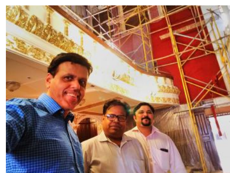
Team Anutone at Royal Opera House during Stretch NRC installation

Almost after 25 years, the pride of Mumbai, a socio-cultural icon, the Royal Opera House opens this week on 20th October with the who's who in attendance for the gala inauguration. The heritage building has been painstakingly restored to as near original condition as possible taking its rightful place back as the jewel in the crown of Mumbai's cultural and theatrical landscape.